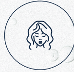
Skin & Hair